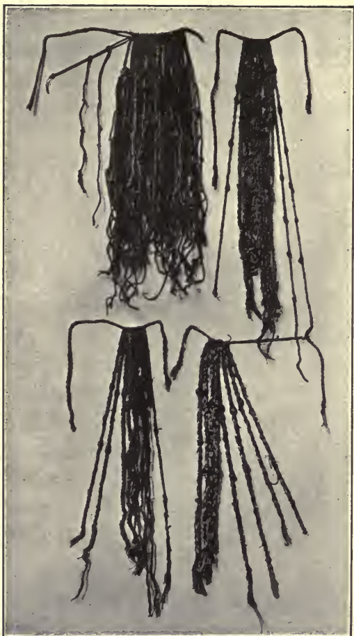
A COLLECTION OF QUIPUS AMERICAN MUSEUM OF NATURAL HISTORY, N. Y. Nos. B 3453, 8704